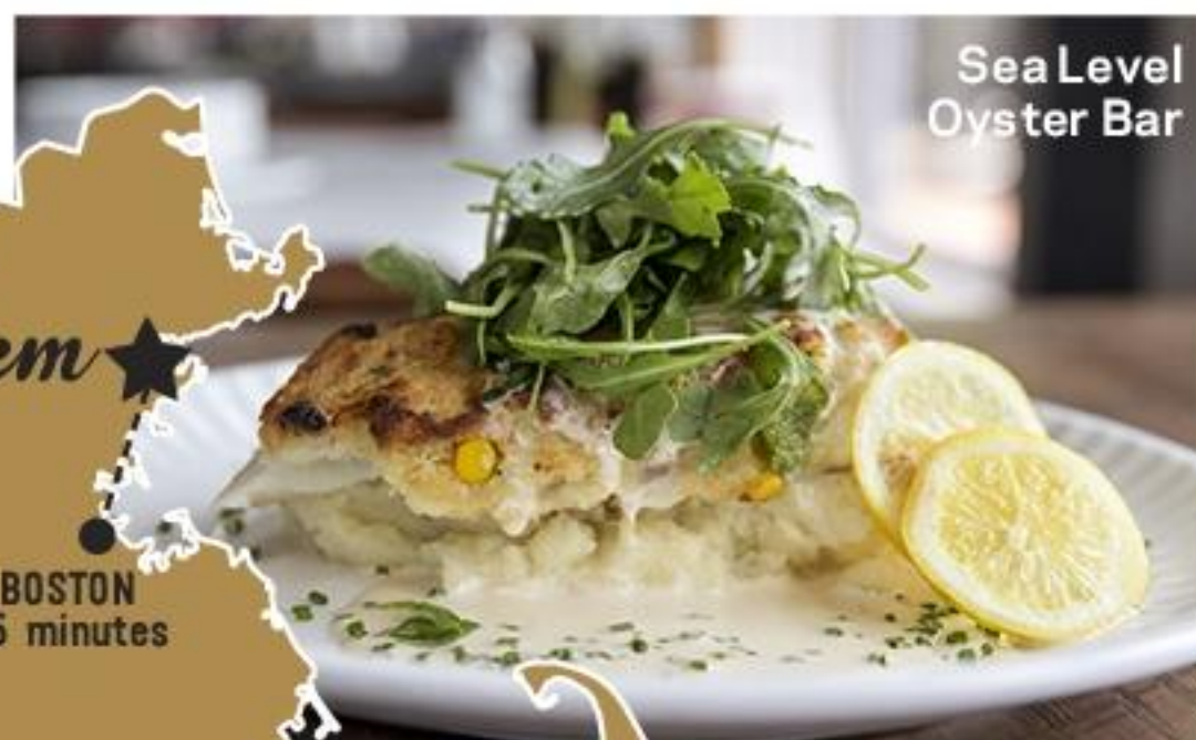
Sea Level Oyster Bar

No other place conjures up the Halloween spirit like this historic New England town.