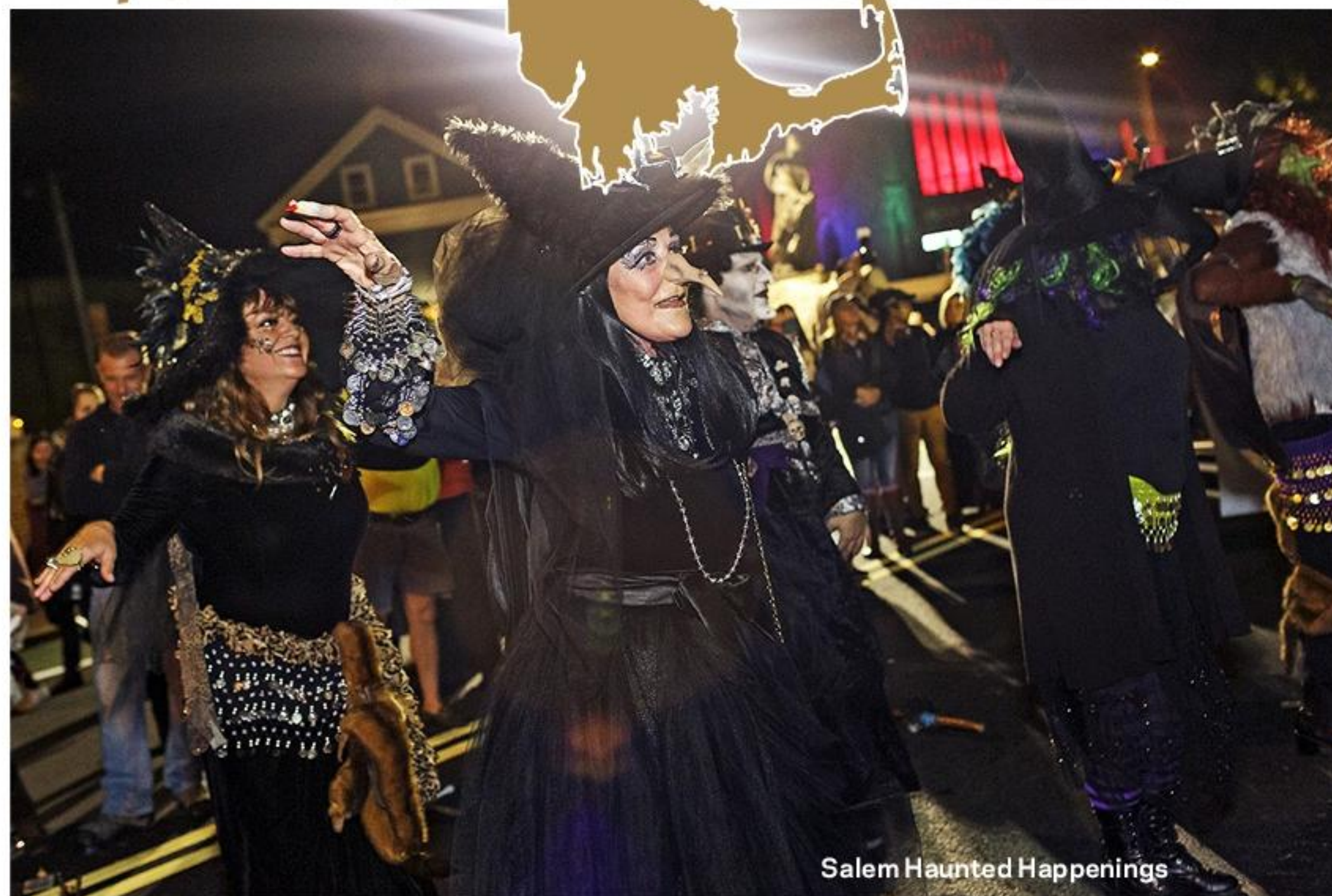
Salem Haunted Happenings